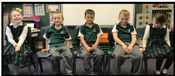
Infants students were all smiles before beginning their mini spelling bee!

On Wednesday Primary students participated in the RIEN Spelling Bee using our video conference technology. We kicked off with a mini spelling bee for our Infants Students, before dialling in to connect with our network of small schools.