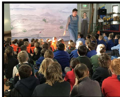
Room on the Rock Picture Book Show @ SFX

Miss J and the infants students would love if everyone could collect the Coles Little Shop 2 Mini Collectables for them to use as part of their learning.