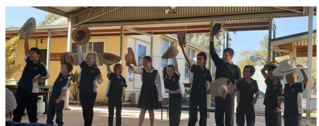
"We're the Boys from the Bush!"