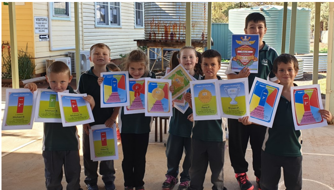
Above: Athletics and Reading Eggs award recipients.