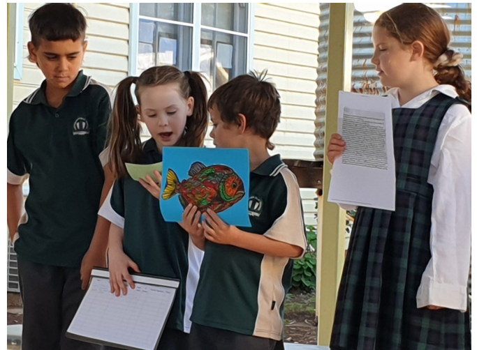
At assembly, students all shared something they are proud of from their learning in Term 2.

Naradhan Public School will be hosting a Dress Yellow Day in support of Daffodil Day for the Cancer Council. Students are asked to bring a gold coin donation and dress in yellow.