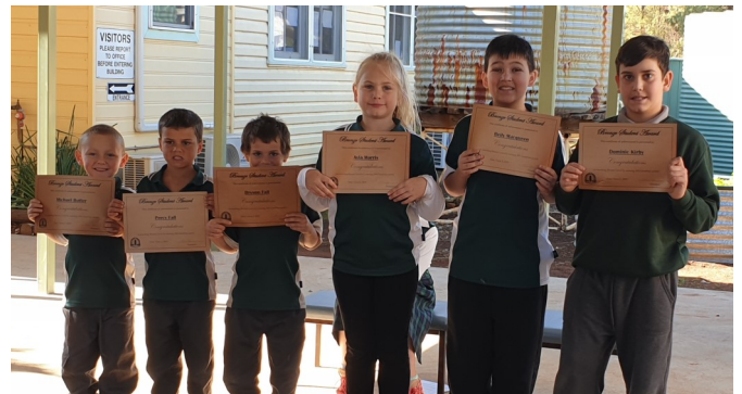
Congratulations to our most recent Bronze students.