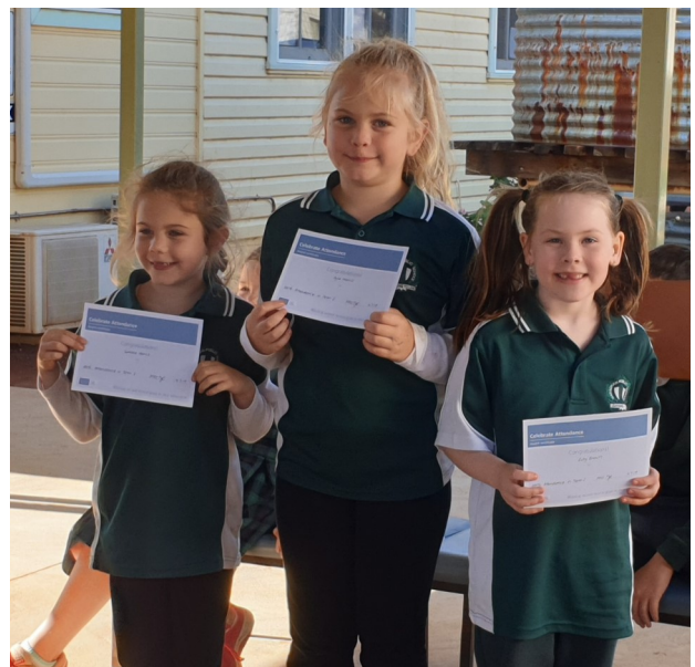
These three committed learners were awarded attendance awards for 100% attendance in Term 2!