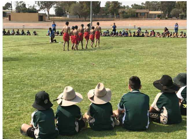
Watching the welcome ceremony.